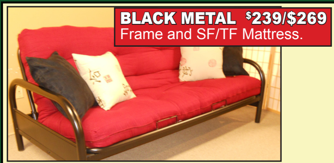
BLACK METAL $239/$269 Frame and SF/TF Mattress.