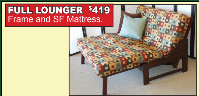
FULL LOUNGER $419 Frame and SF Mattress.

10% Off Comfort Coil Futon Mattress Firm, healthful support like the best mattresses yet flexible enough to fold on a futon frame Plus 10% off entire stock of futon mattresses. Cotton with foam cores, euro coils and plush, super-resilient synthetics.