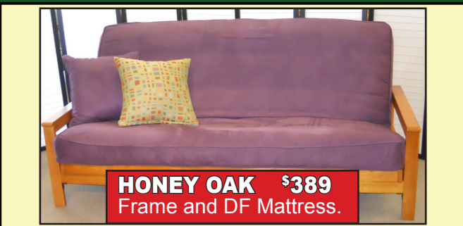
HONEY OAK $389 Frame and DF Mattress.